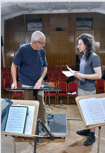
Workshop shots: rehearsals and meetings

Her notable works: 24 Preludes , Erwachen des Grüns , Ihr Prolog , LANLAN , VUCA , among others. In recent years, she has aimed to interpret the romanticism of classical music through the techniques of contemporary music. Furthermore, she uses her contemporary, experimental-technical musical language to express emotions, tell stories, or recite like a poem. In other words: to describe music through music itself – that is enough.