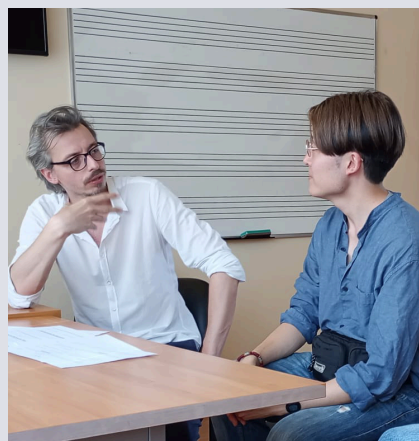
Workshop shots: rehearsals and meetings of students with tutors and musicians

At the moment, my interests include the sounds of the human body, contemporary dance, microtonal harmonies, the voices of writers I admire, Scriabin, Edouard Vuillard and stones.