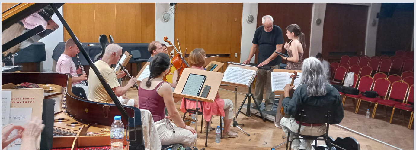
Workshop shots: rehearsals and meetings of students with tutors and musicians

His compositional oeuvre consists of chamber pieces, choir music, music for solo instruments, film music, incidental music and various arrangements. His works has been performed in Bulgaria, Austria, Russia, Croatia, Brazil, Canada and others.