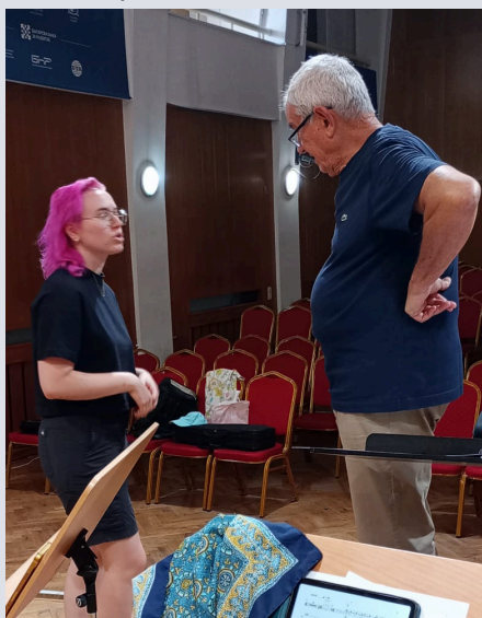
Workshop shots: rehearsals and meetings of students with tutors and musicians